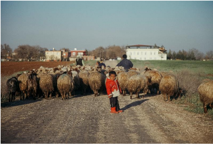
Gaziantep, Türkiye

Located in south-central Turkey, Gaziantep is the centre of the country's pistachio cultivation. Extensive orchards, vineyards, and olive groves surround the city, which boasts more than 160 bakeries producing Gaziantep's famous syrup-soaked baklava.