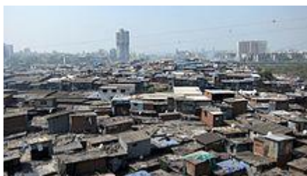
Dharavi shanty town

There are more urban poor in India than in any other nation and 1 in every 6 urban Indians lives in a slum. Earlier this year a group of Frontiers workers spent several days in the mega-city of Mumbai, visiting urban slums like Dharavi (the setting for the film 'Slumdog Millionaire') with a population of over 1 million people, and praying for more workers for this harvest field. You can get a brief insight of what life is like for the people of Dharavi in this short YouTube clip here .