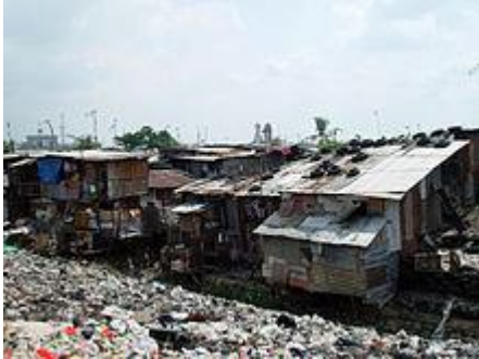
A shanty town in Jakarta, Indonesia, Asia

The urban poor comprise one of the biggest and fastest growing sectors of society across much of the globe, particularly in Africa and Asia where most Muslims live. Although accurate figures are hard to come by, one estimate is that there are already more than 250 million Muslims living in slums, shanty towns and poor urban neighbourhoods across the world; a number which will grow rapidly in the coming decades.